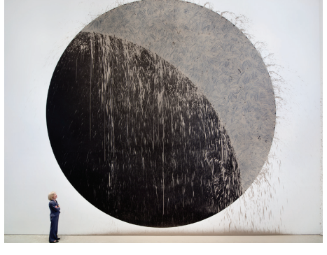
(Image) Richard Long, River Avon Mud Crescent, Sperone Westwater Gallery, New York.