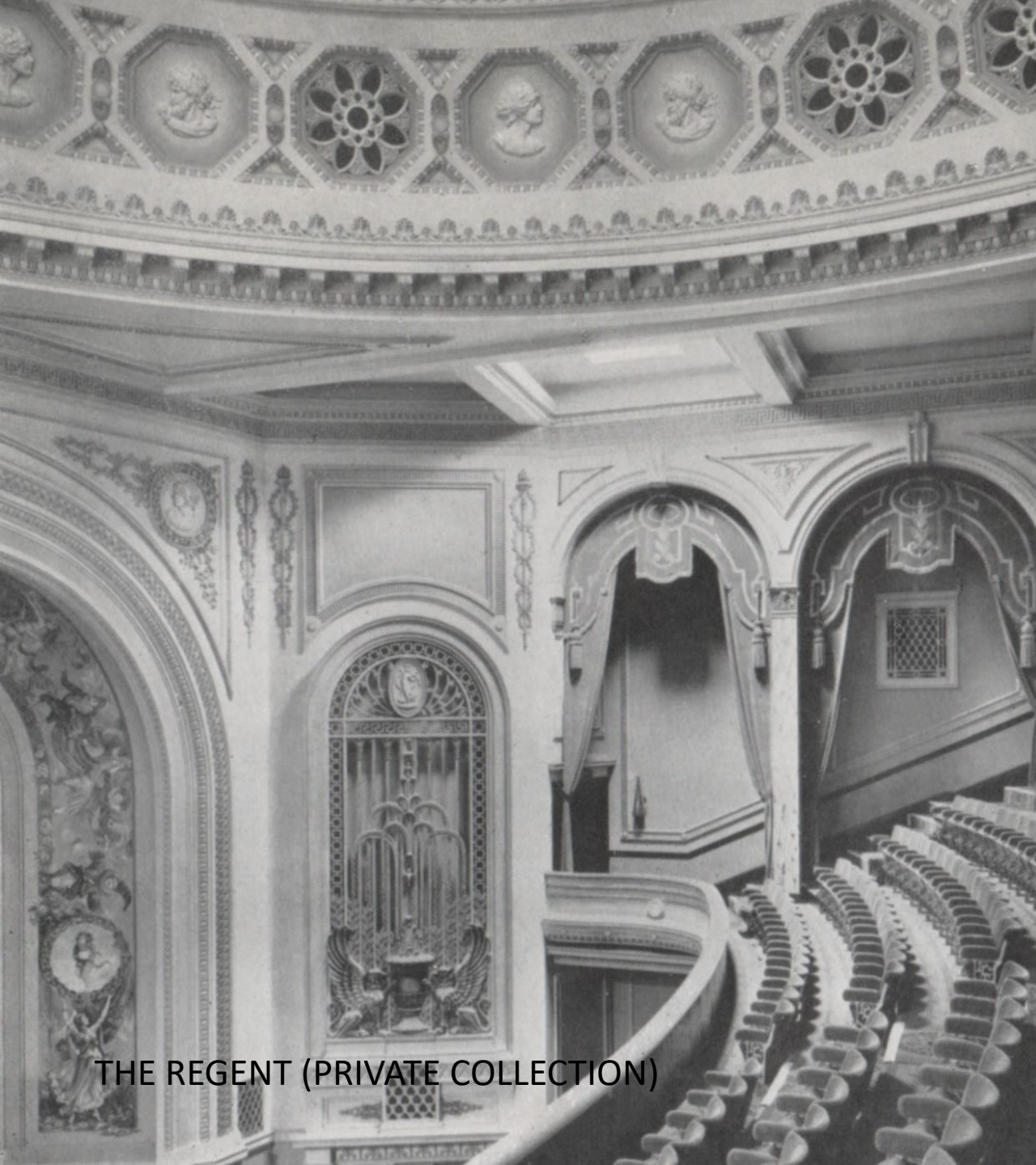
THE REGENT (PRIVATE COLLECTION)