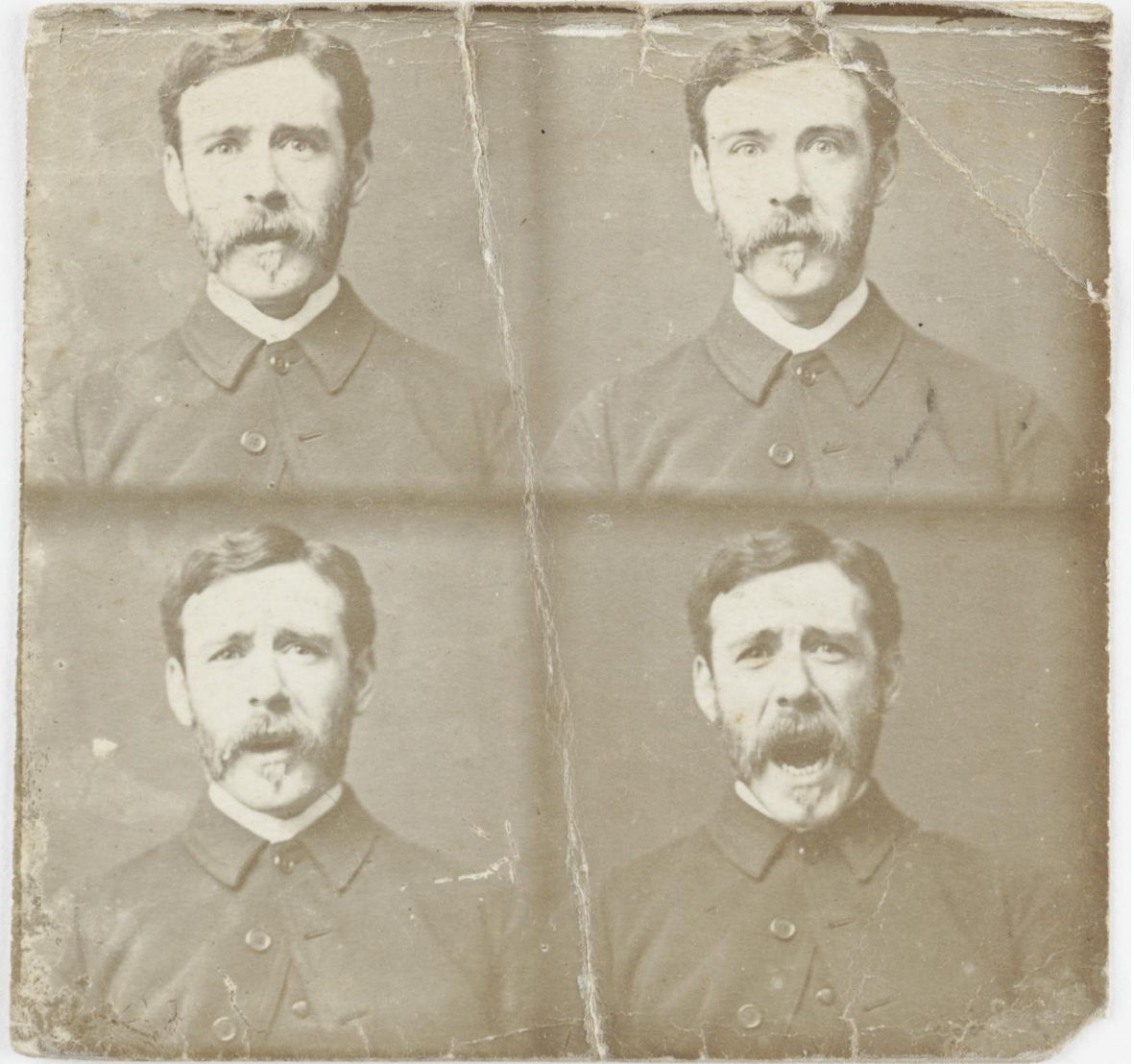
WILLIAM FRIESE-GREENE