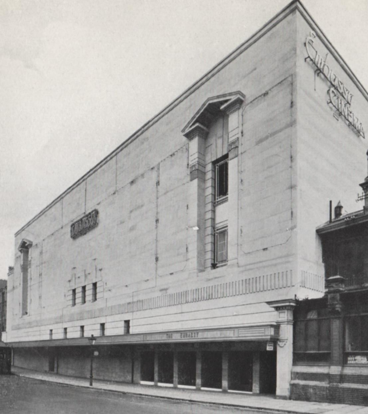
THE EMBASSY CINEMA (PRIVATE COLLECTION)