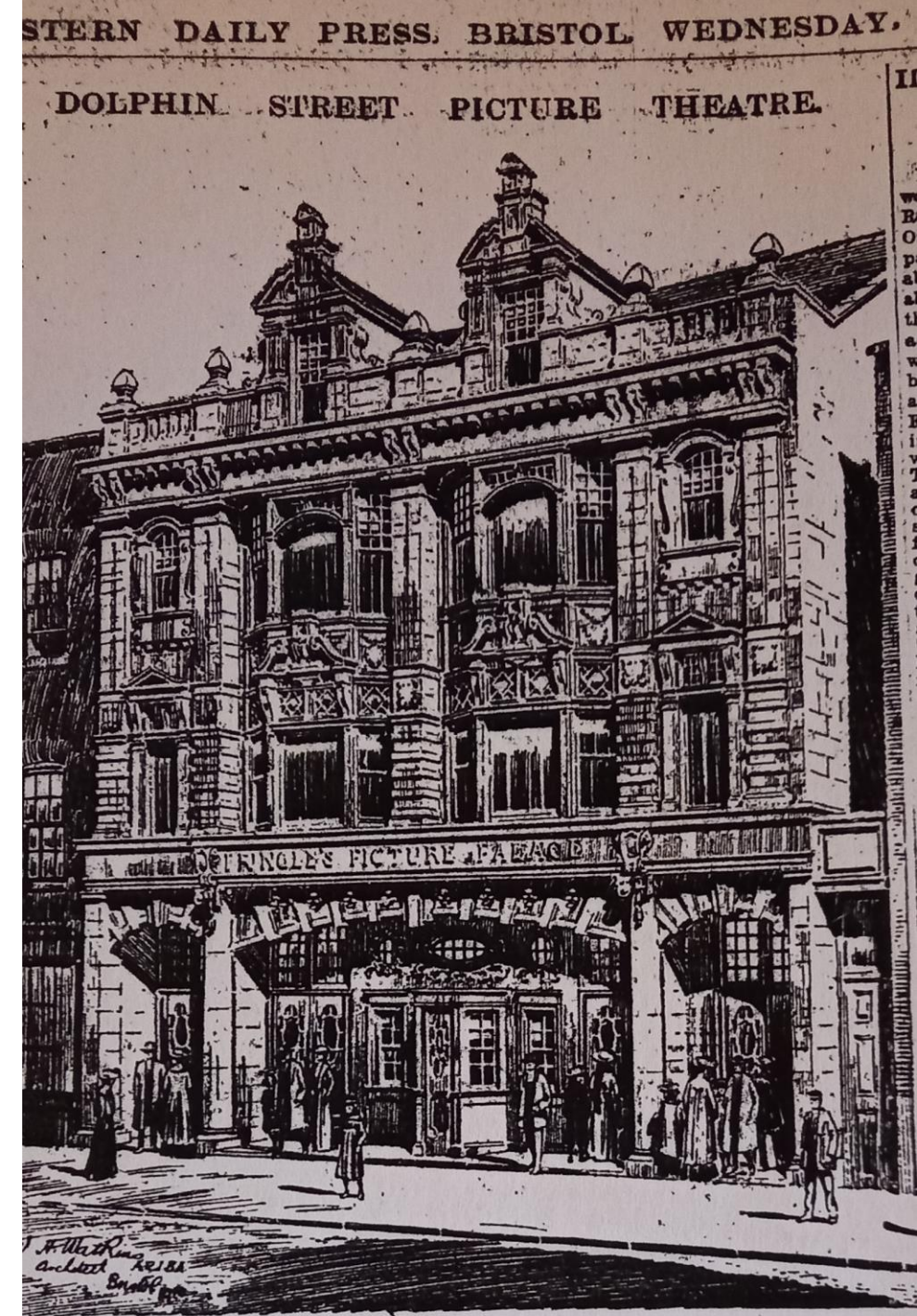
THE DOLPHIN STREET PICTURE THEATRE