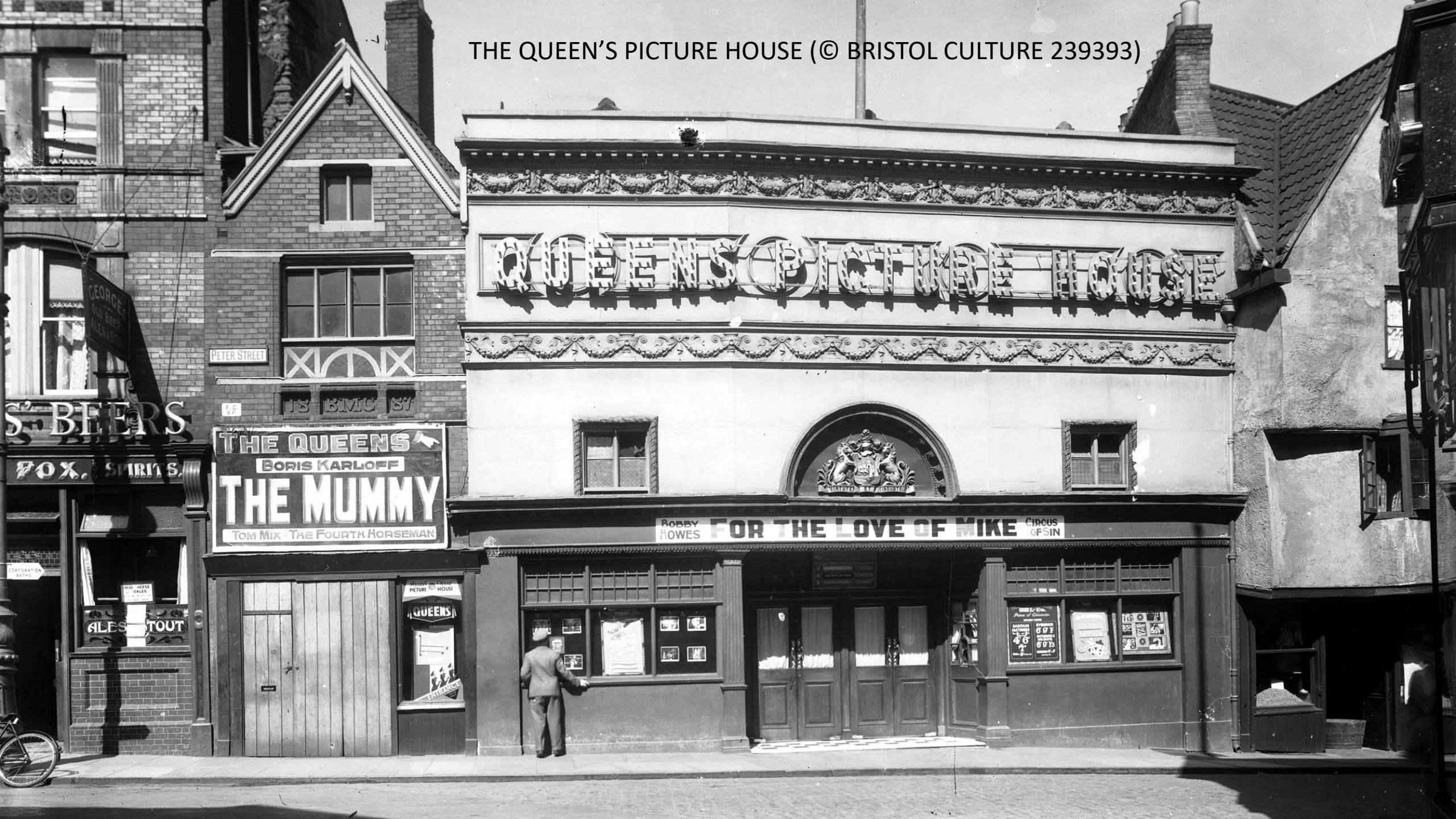
THE QUEEN'S PICTURE HOUSE