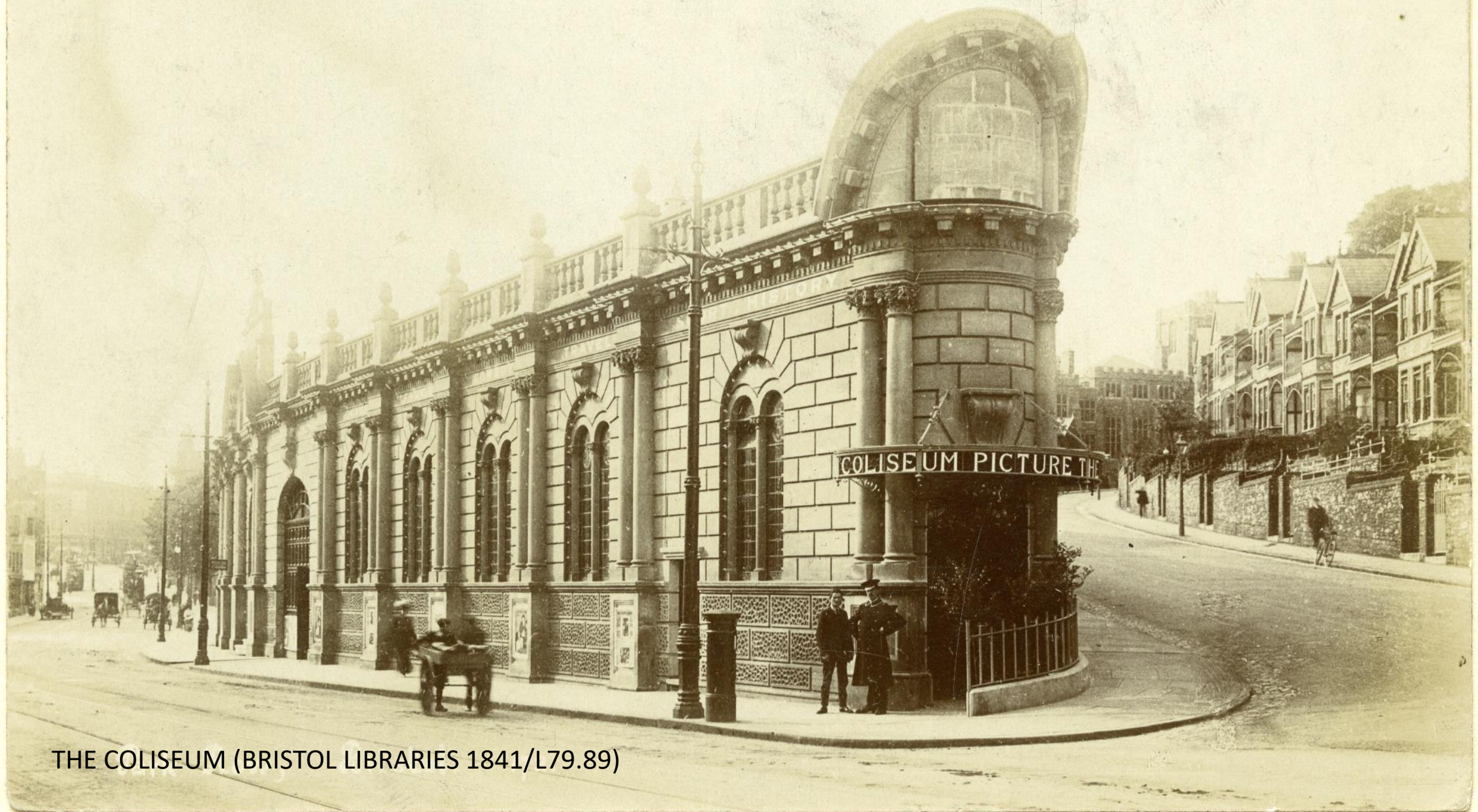
THE COLISEUM